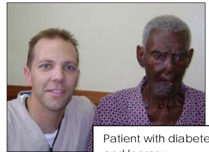
Patient with diabetes and leprosy.

It was good to use the ‘ol diagnostic skills again to their fullest rather than the typical chiropractic complaints and wellness care I have primarily seen for the last 10+ years. We saw patients with you name it...typhoid, diabetes, prenatal checkups, leprosy, stroke victims, high blood-pressure, amputees, worms...everything you could think of. Many came in with handmade crutches or a loved one brought them in wheel barrel. Many we could help, some we couldn't.