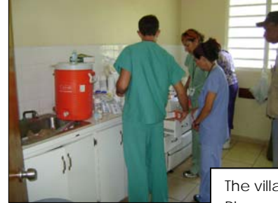
The village Pharmacy

It was good to use the ‘ol diagnostic skills again to their fullest rather than the typical chiropractic complaints and wellness care I have primarily seen for the last 10+ years. We saw patients with you name it...typhoid, diabetes, prenatal checkups, leprosy, stroke victims, high blood-pressure, amputees, worms...everything you could think of. Many came in with handmade crutches or a loved one brought them in wheel barrel. Many we could help, some we couldn't.